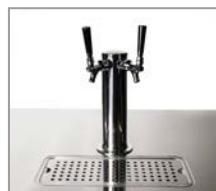
Custom Tap Options