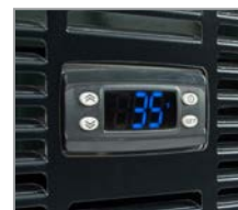
Precise Temp Control