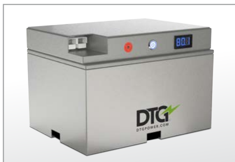
DTG MPower 3100 Battery

DTG's MPower Battery System is at the heart of every PowerStation