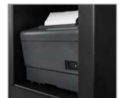
POS Printer Integration