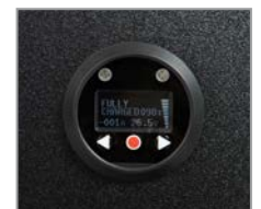
Power Level Monitor