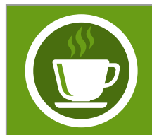
Custom Magnetic Sign