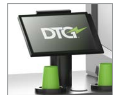
POS System Integration