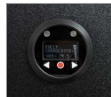
Power Monitor Gauges