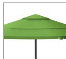
9' Umbrella Mount