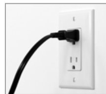
110V Outlet Charging