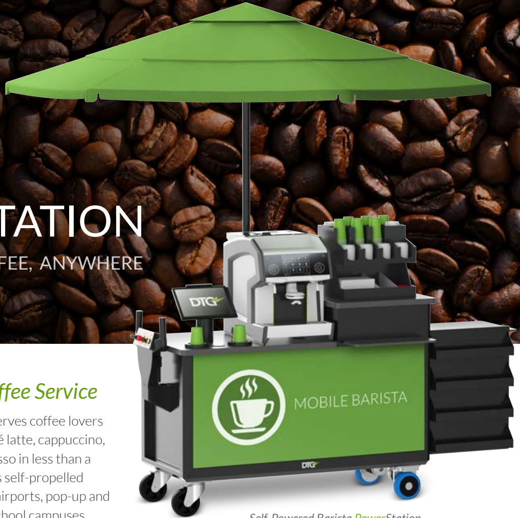
Self-Powered Barista PowerStation

The DTG Barista PowerStation serves coffee lovers with premium freshly brewed café latte, cappuccino, macchiato, Americano, and espresso in less than a minute wherever it's needed. This self-propelled station can easily be deployed in airports, pop-up and remote events, office buildings, school campuses, fairs and festivals, private events, micro markets, and more.