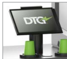
POS System Integration