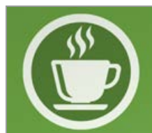
Custom Magnetic Sign