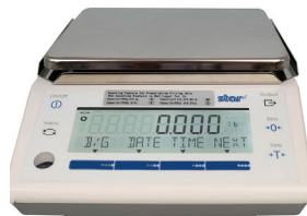
mG-S1501 Precision POS Scale