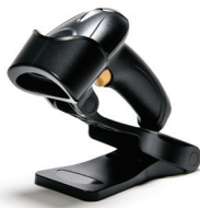
Wireless Handheld Scanner

Once you've set up the main portion of your workstation, it's time to build onto it with connected hardware that can streamline data input into your POS system and enhance customer experience. Based on your workstation's flow, determine if you need items like barcode scanners and scales.