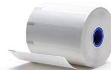
Traditional & Linerless Labels