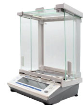
mG-S322 Precision POS Scale