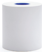
Thermal Receipt Paper