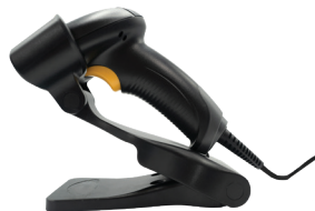
USB Handheld Scanner