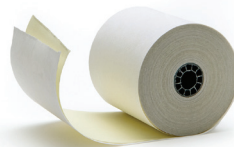
Standard Bond Paper