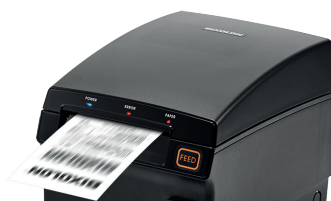
Built-in power supply