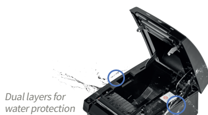
Dual layers for water protection