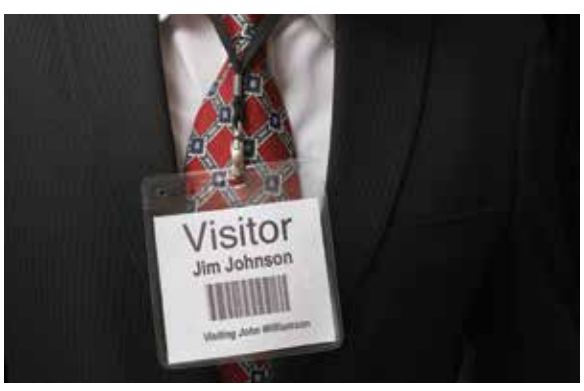
Employee and Visitor Identification