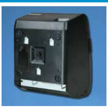
Built-In Wall Mount Capability