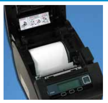
Drop and Print Paper Loading - Optional Paper Width Selector Allows 58mm Wide Paper Rolls