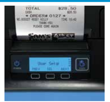
Liquid Crystal Display Guides the Operator Through Setup and Option Selections