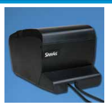
Standard Cable Management Cover