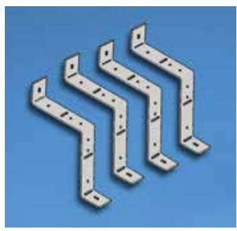
Easily Mounts Under the Counter with Optional Universal Brackets