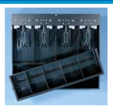
4 Bill / 5 Coin Insert with Removable Coin Section and Adjustable Coin Dividers