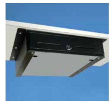
Easily Secure Under a Counter with the Available Model 13 Under Counter Brackets