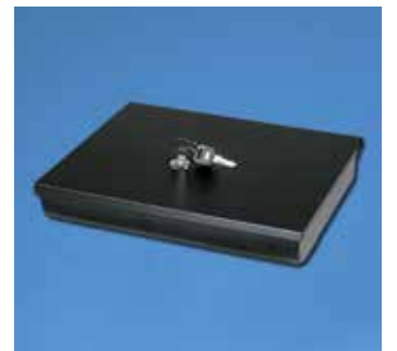
Optional Locking Lid Available to Transfer Cash and Media