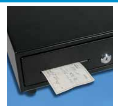
Checks and Card Slips Can be Inserted into the Media Slots Without Opening the Drawer