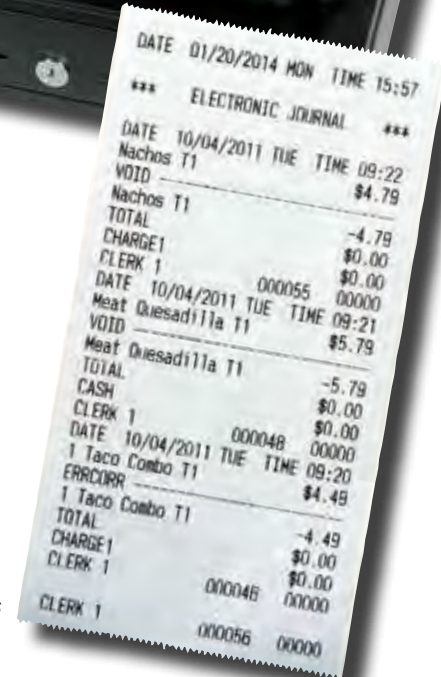
Electronic Journal Report sorting only voids shown 75% actual size.

The journal can be archived electronically for printing at end-of-day, or can be collected on an SD card. A variety of electronic journal options are available that allow you to quickly audit selected activities.