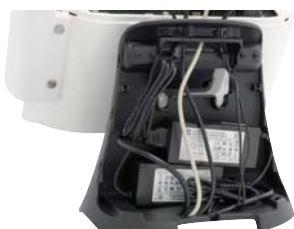
Spacious stand storage space