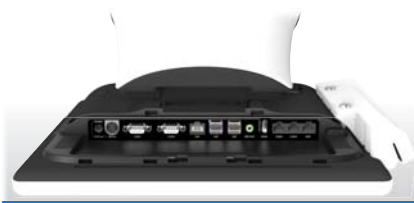
Arranged in a row I/O port