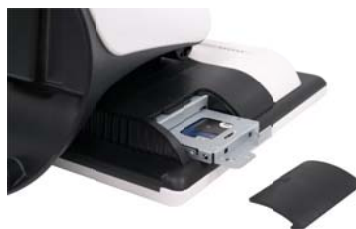
Easy disassembly for A/S process