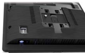
Easy USB connection