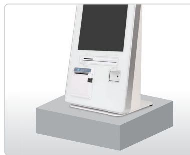
Space efficient model