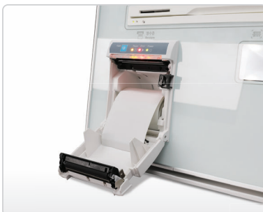
Easy disassembly for A/S process