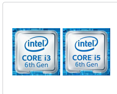
Powerful Performance - Sky Lake / Kaby Lake