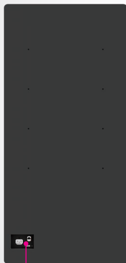
Power & Ethernet