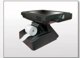
Drop-in paper loading