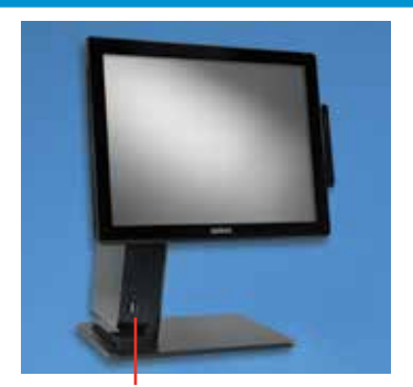
Two Additional USB Ports – Choice of Processors