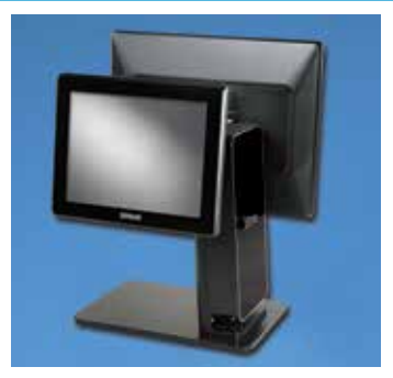
Choose From 9.7" or 15" Optional Integrated Rear LCD Customer Displays