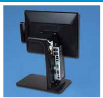
Easy Access to Ports -Easily Replace SSD and RAM Without Tools