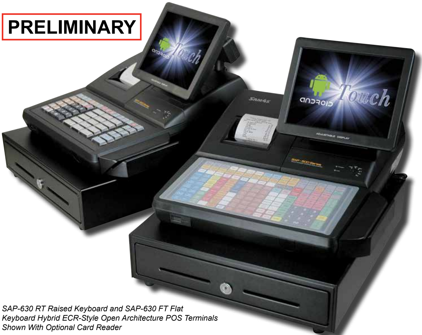
SAP-630 RT Raised Keyboard and SAP-630 FT Flat Keyboard Hybrid ECR-Style Open Architecture POS Terminals Shown With Optional Card Reader