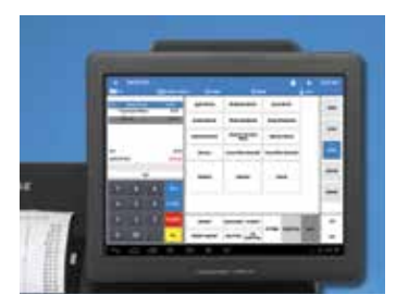
Use the adjustable 9.7" color touch screen for operating the POS solution by touch.

An extremely cost-effective and environmentally friendly bundle – each SAP-630 Series includes a large 9.7" touch screen, high quality integrated thermal printer, international-style cash drawer, choice of raised-key or flat spill-resistant keyboard, rear customer display and a secure SD port