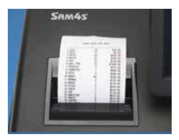
Reliable high-speed thermal receipt printer prints full-width 80mm paper and features quick and easy drop-in paper loading.