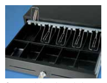
Commercial grade cash drawer features a 5 bill, 5 or 6 coin insert, two media slots and a standard security lock and key.