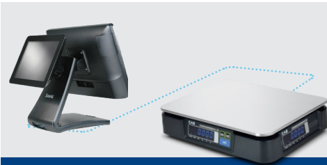
Connect to most POS/ECR systems

Your perfect partner for effortless sales of any item that requires weighing in a point of sale application