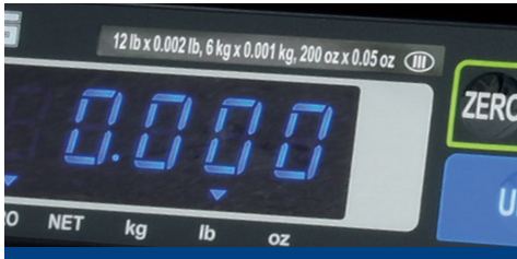
Easy to Read Crystal Clear Display