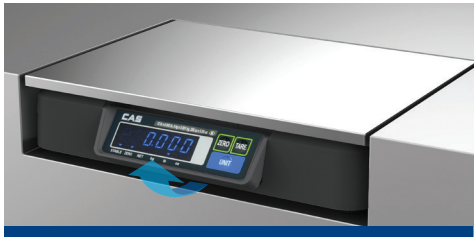
Edge Tray for Recessed Applications