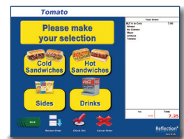
Customer Self Ordering